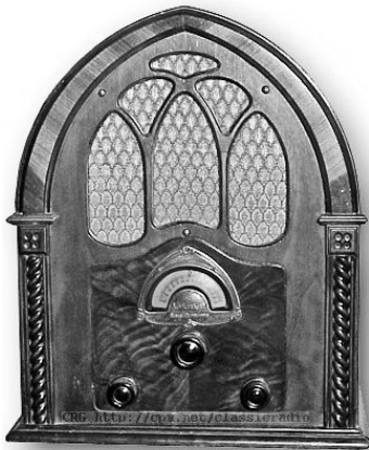
Atwater Kent 82

Also in the auction will be a nearly mint very original Atwater Kent model 82 cathedral. A good friend of mine has asked me to help him sell this radio that was donated to their missionary group. The proceeds will go to help support a school for children in Columbia South America. These children literally have nothing and any money from the sale of this radio will go a long way to helping them attend school. Since this is a charity sale, we will waive the auction fee so every penny goes to the school.